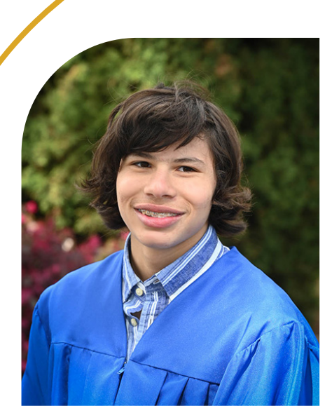
Speeches & Reflections: